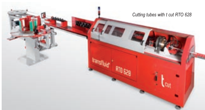
Cutting tubes with t cut RTO 628