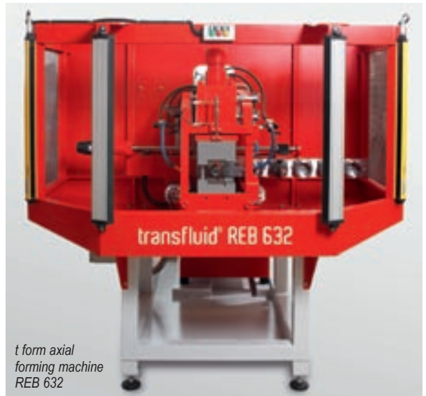
t form axial forming machine REB 632

The cleaning process is becoming increasingly important in tube processing. "For the material flow it would not be sensible to put the tubes in baskets to carry them in the cleaning machine and separate them after